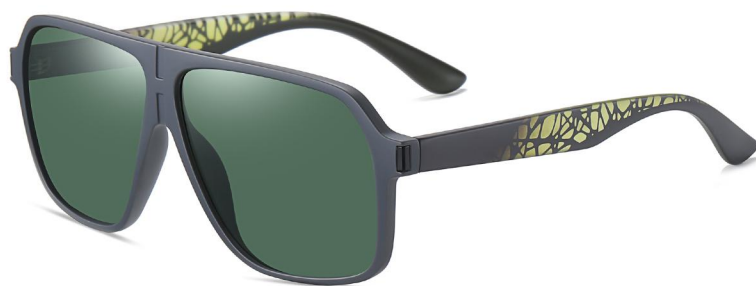
N0.2 哑深灰G15片 C169-P25