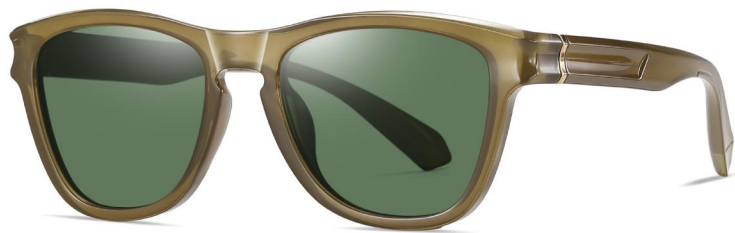
N0.5 Bright Brown / Gold Green C731-P243