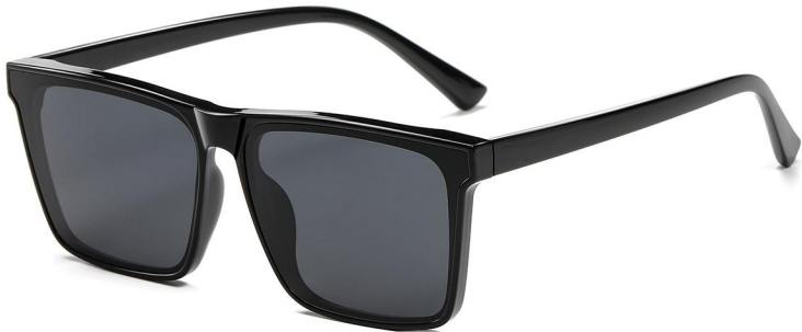
N0.1亮黑灰片 C01-P01 (小号)