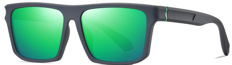
N0.4 Grey / Green Green coated C520-P14