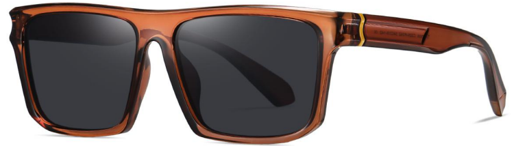
N0.2 Tea / Yellow Grey C326-P242