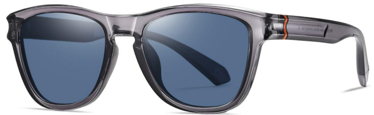
N0.2 Bright Grey / Orange Blue C541-P239