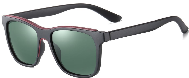
N0.1 哑黑/G15 C04-P25