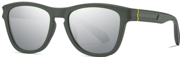
N0.3 Green / White Silver C523-P194