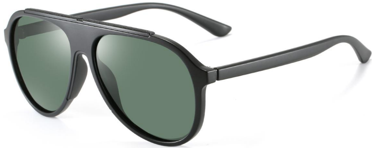
N0.3 哑黑/G15 C04-P25