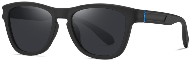
N0.1 Black / Blue Grey C73-P242