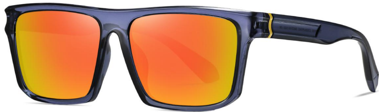
N0.3 Blue / Yellow Red coated C344-P29