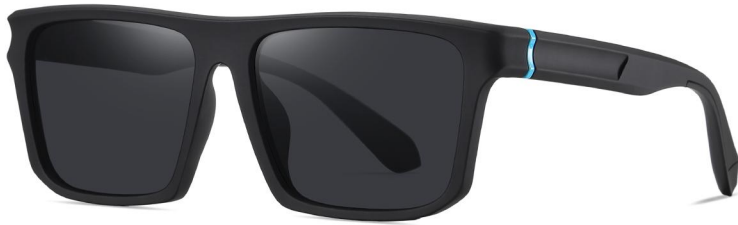
N0.1 Black / Blue Grey C01-P242