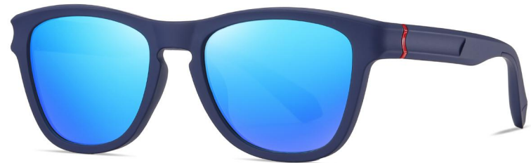
N0.4 Blue / Red Ice Blue C668-P06