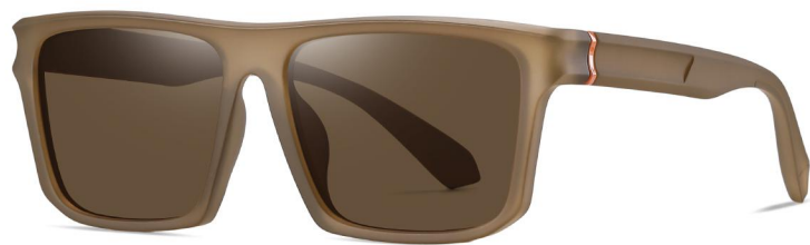
N0.5 Light Green / Orange Tea C671-P240