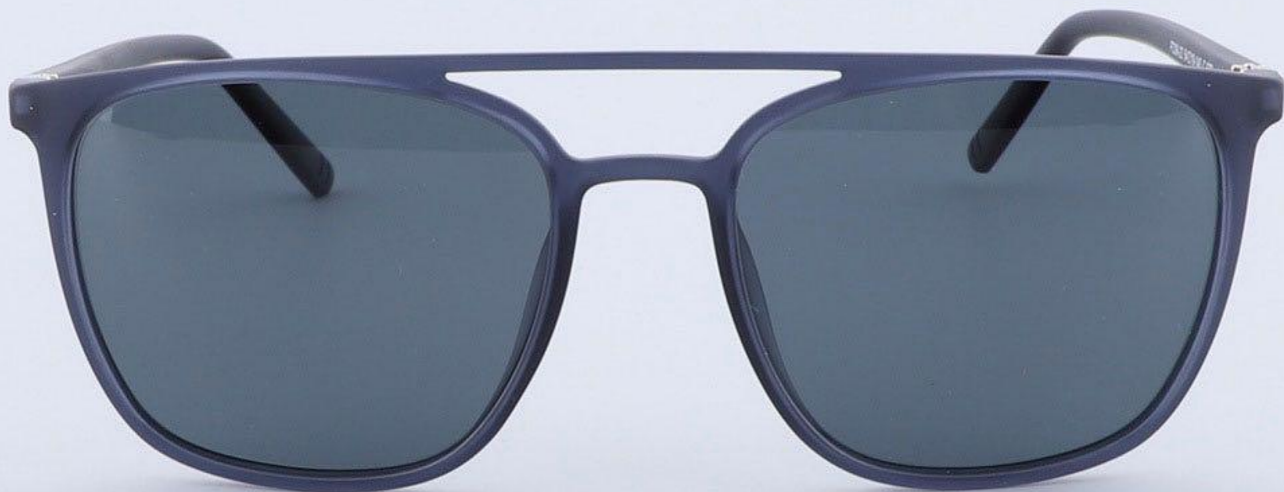
FC09-22 54-19-145 TR9 / Polarized