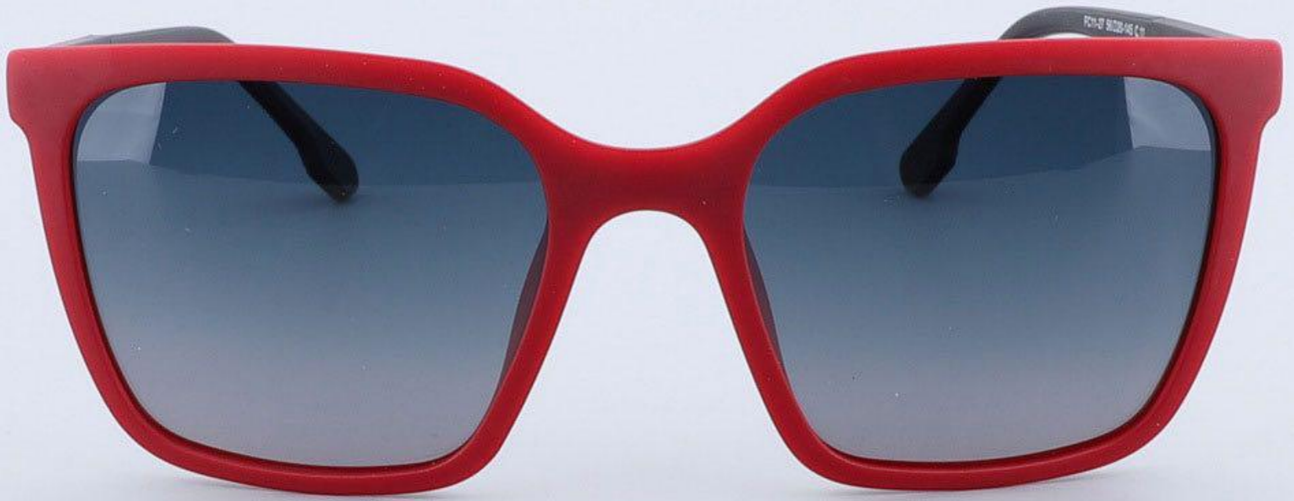
FC11-27 56-10-145 TR90 / Polaiized