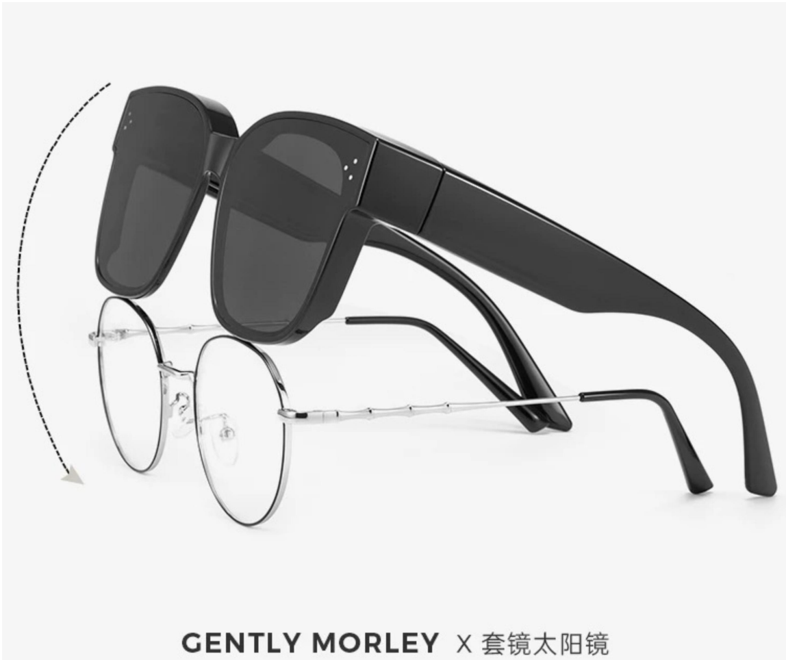
GENTLY MORLEY X 套镜太阳镜