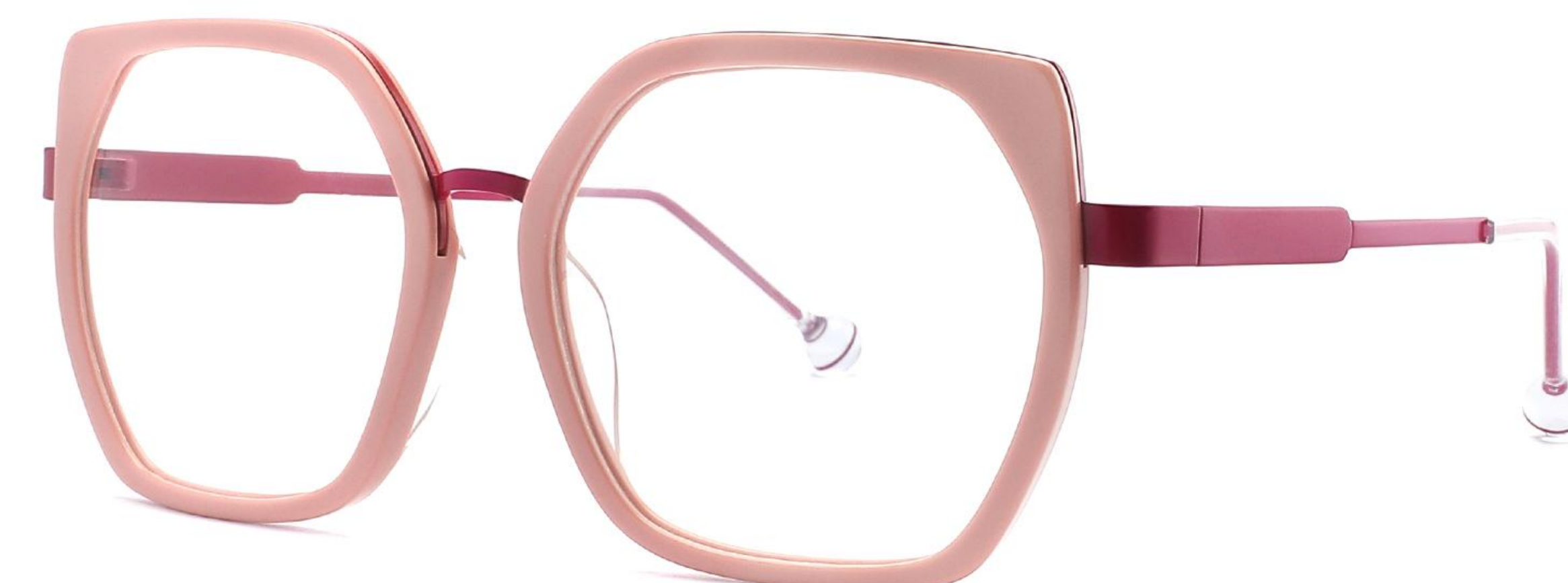
C2 LIGHT PINK