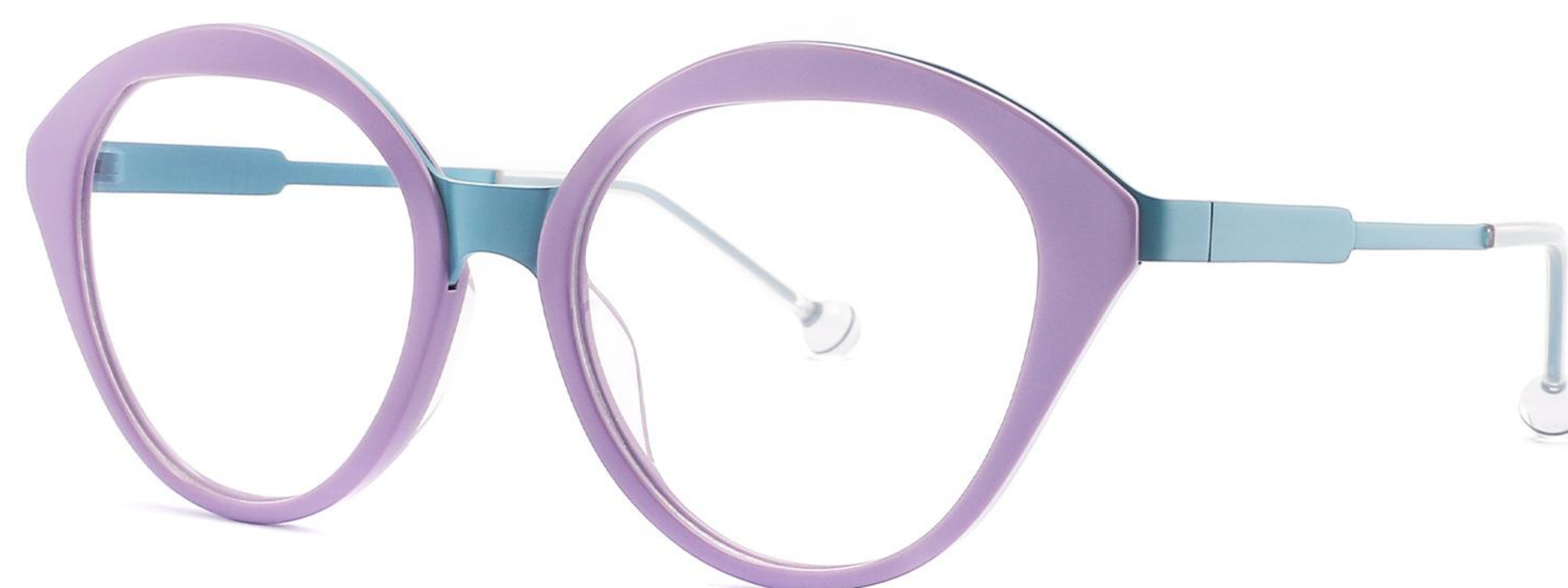
C1 LIGHT PURPLE