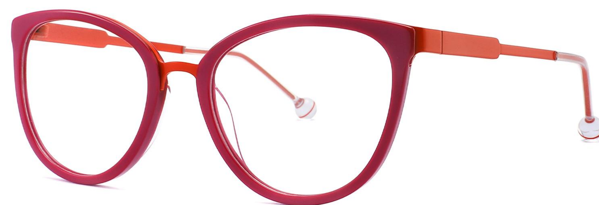
C3 ROSE RED