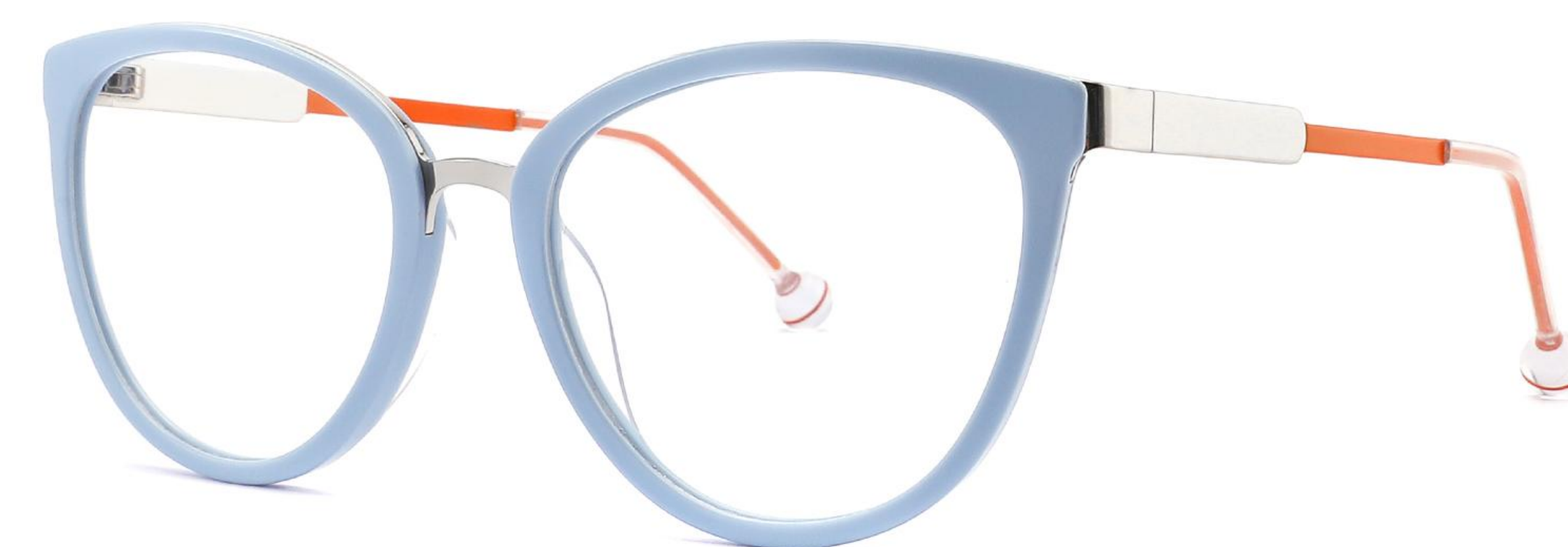
C2 LIGHT BLUE