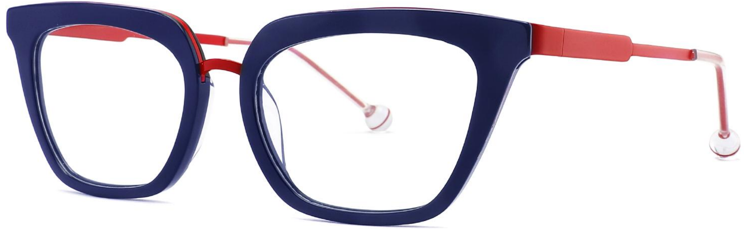
C2 DARK BLUE