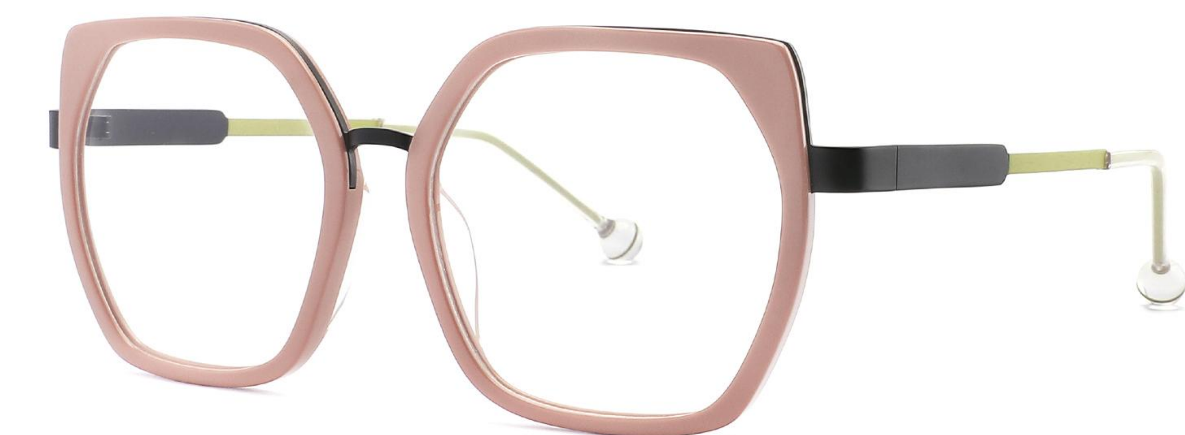
C4 LIGHT BROWN