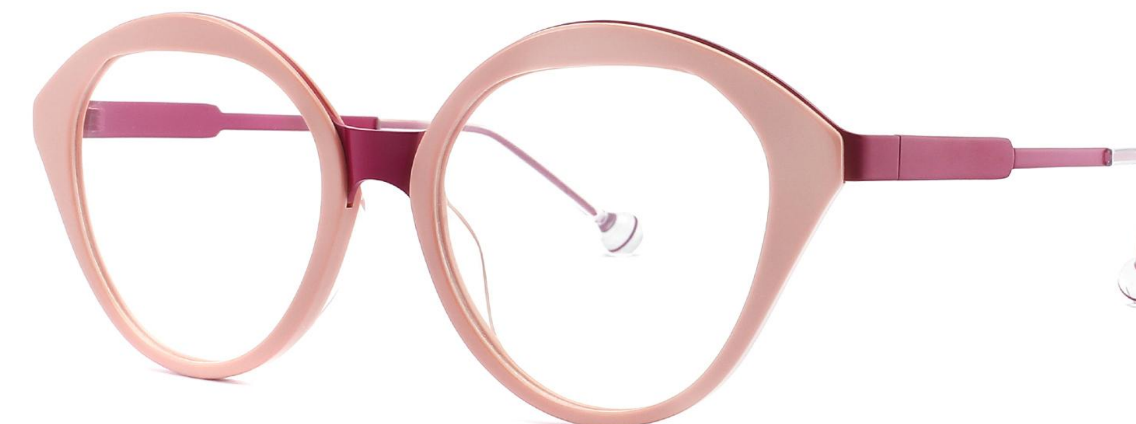
C4 LIGHT PINK