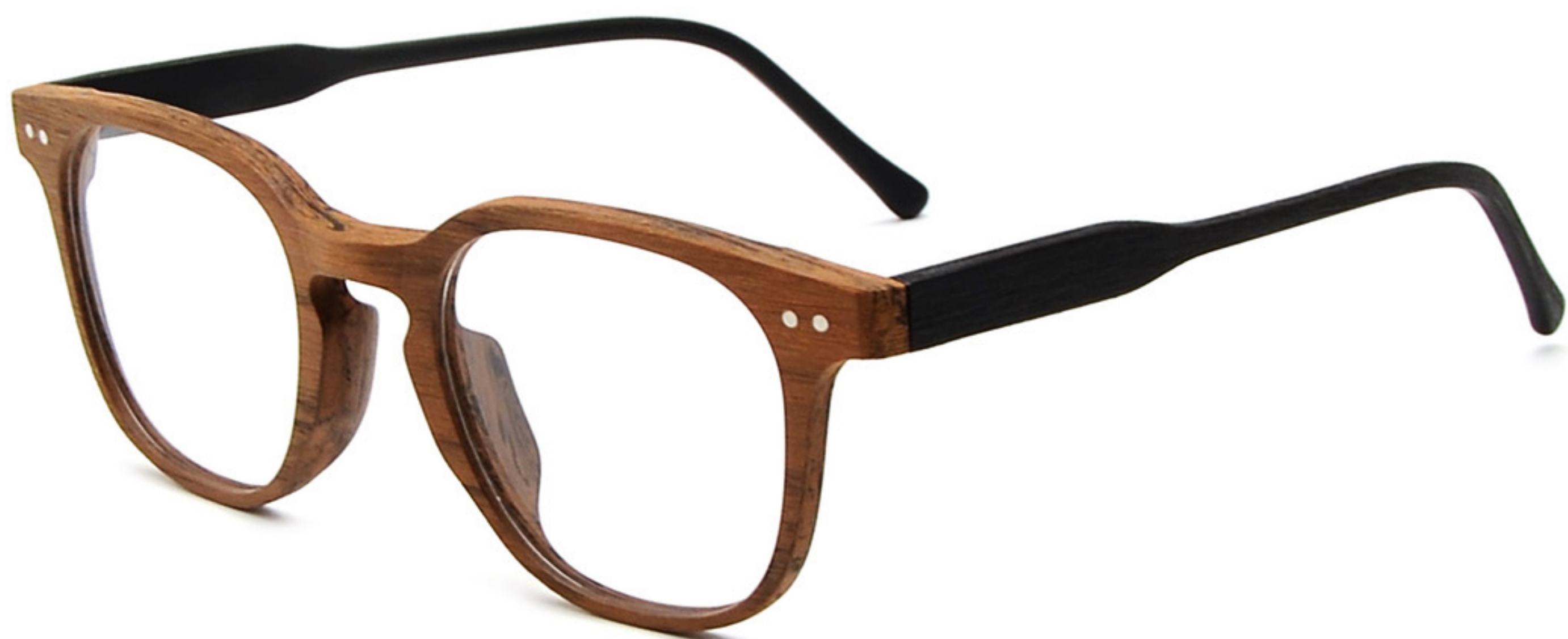
BROWN LEG BLACK C90 棕框黑腿