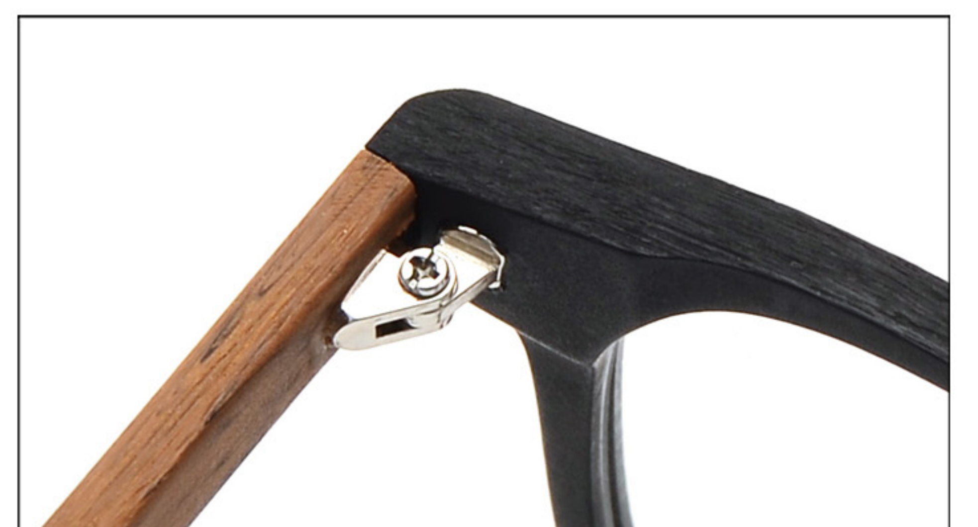
金属铰链 METAL HINGE