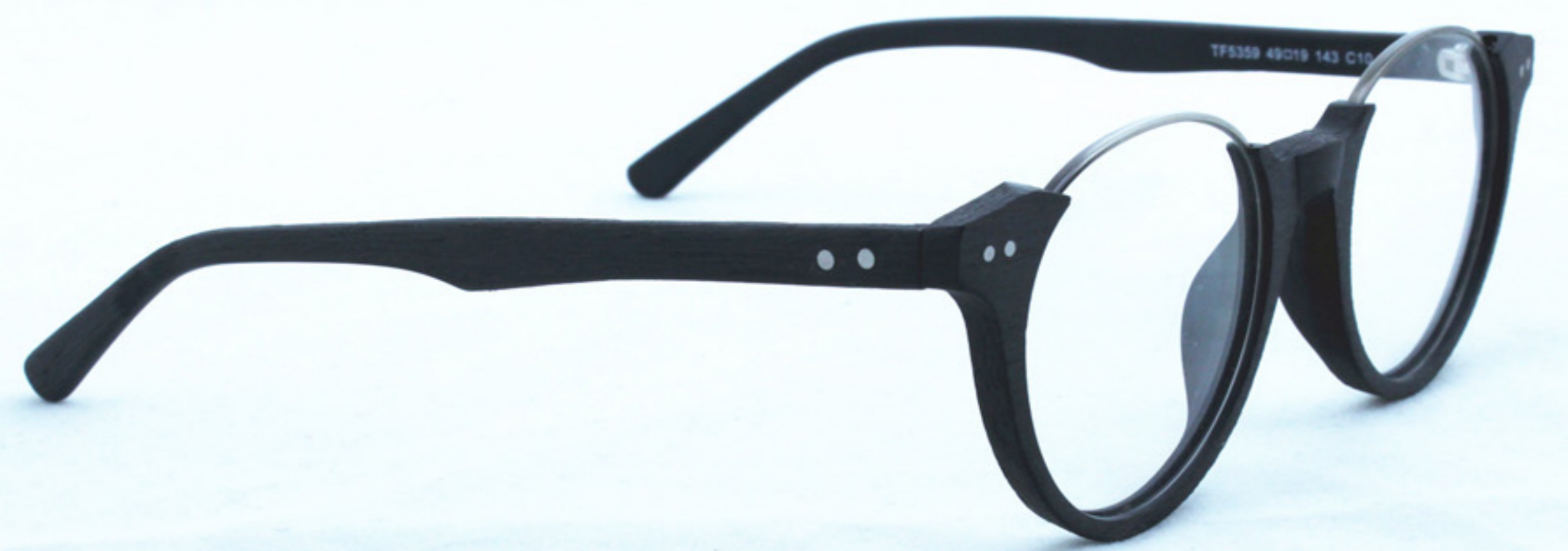
TF5359 C10 (2)