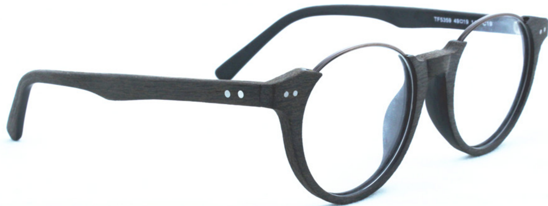
TF5359 C19 (2)