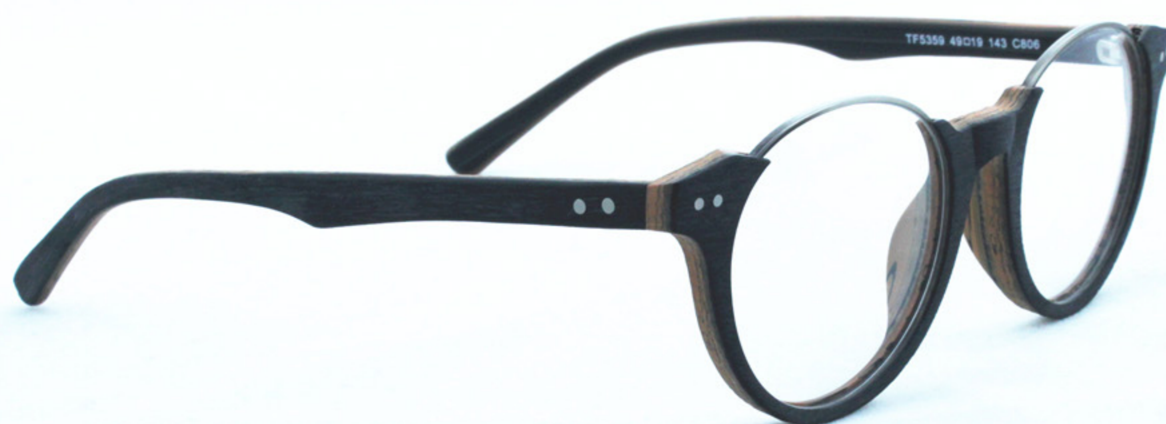
TF5359 C806 (2)