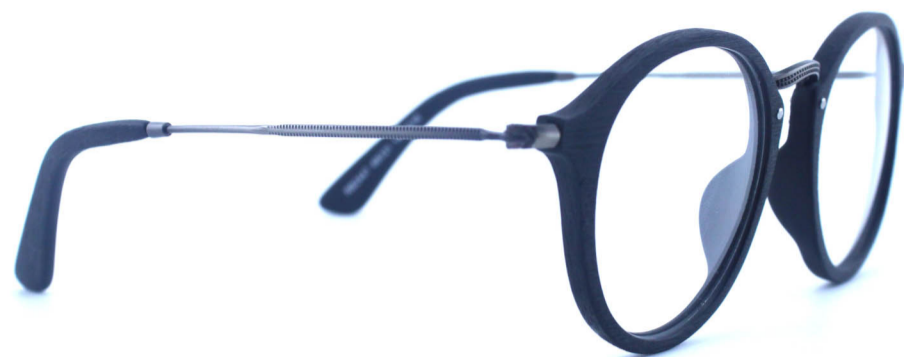
RB2447 C10 (2)