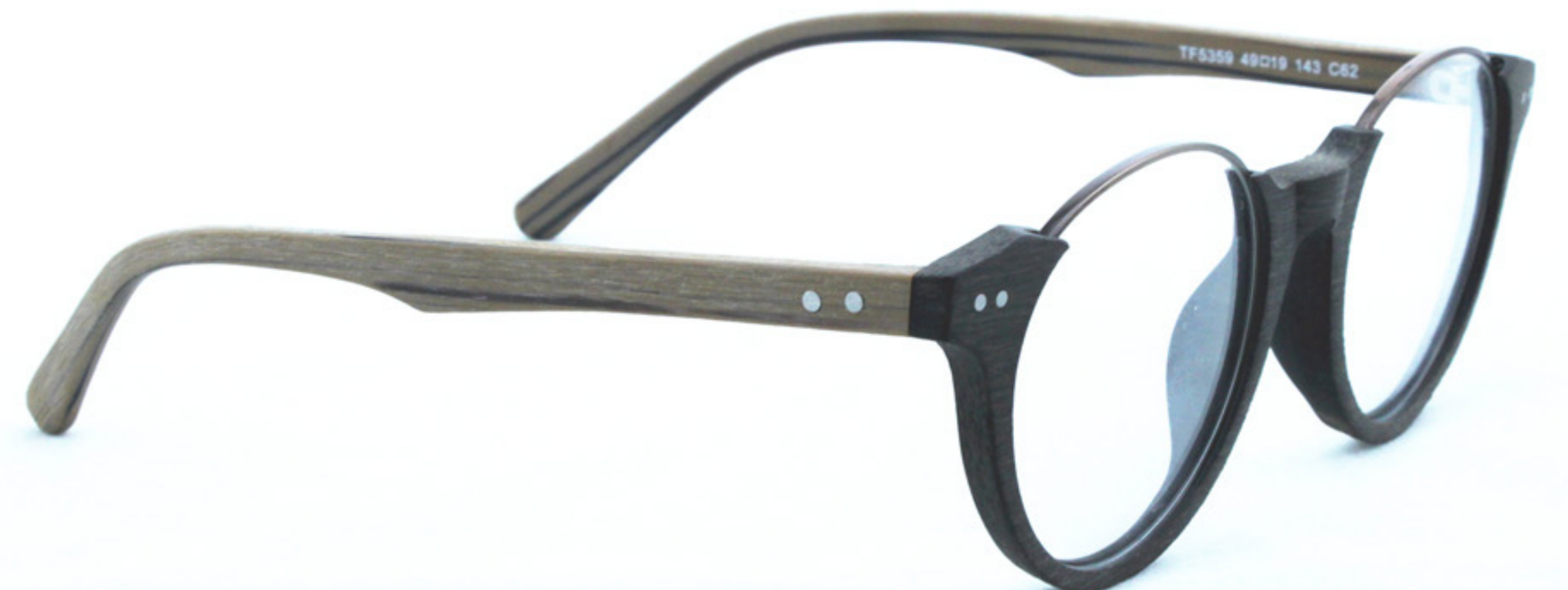
TF5359 C62 (2)