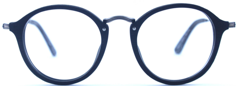
RB2447 C10 (1)