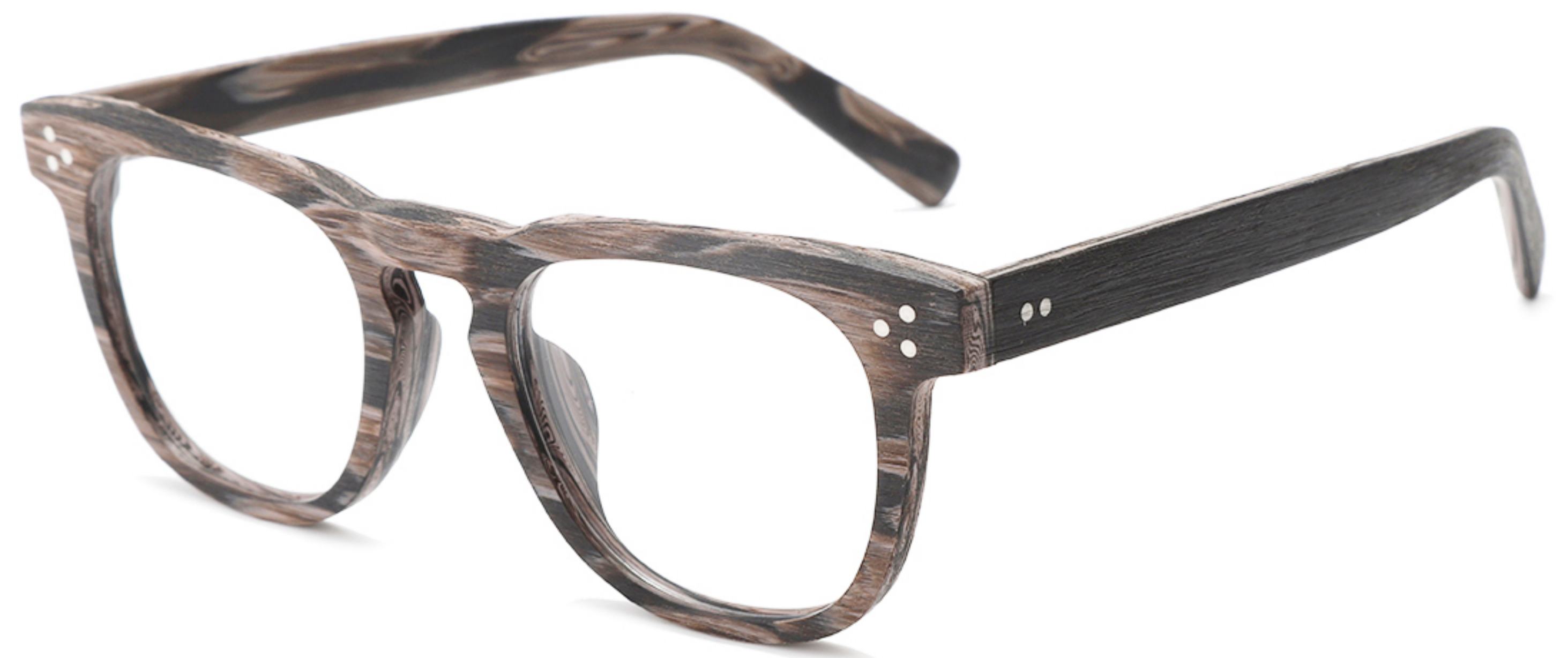
GRAIN GRAY C15 木纹灰框