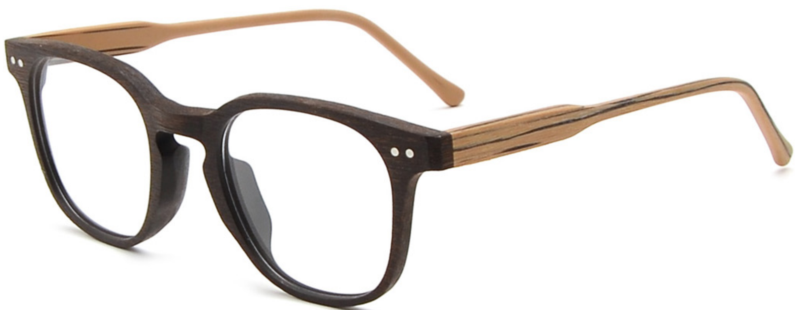
BROWN WOOD LEG C62 茶框木腿