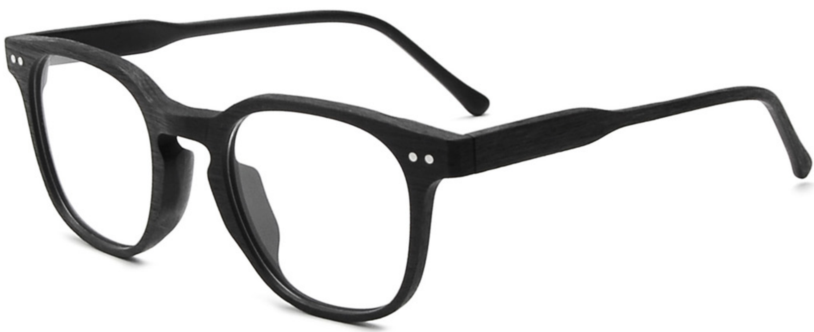
WOOD GRAIN BLACK C10 木纹黑