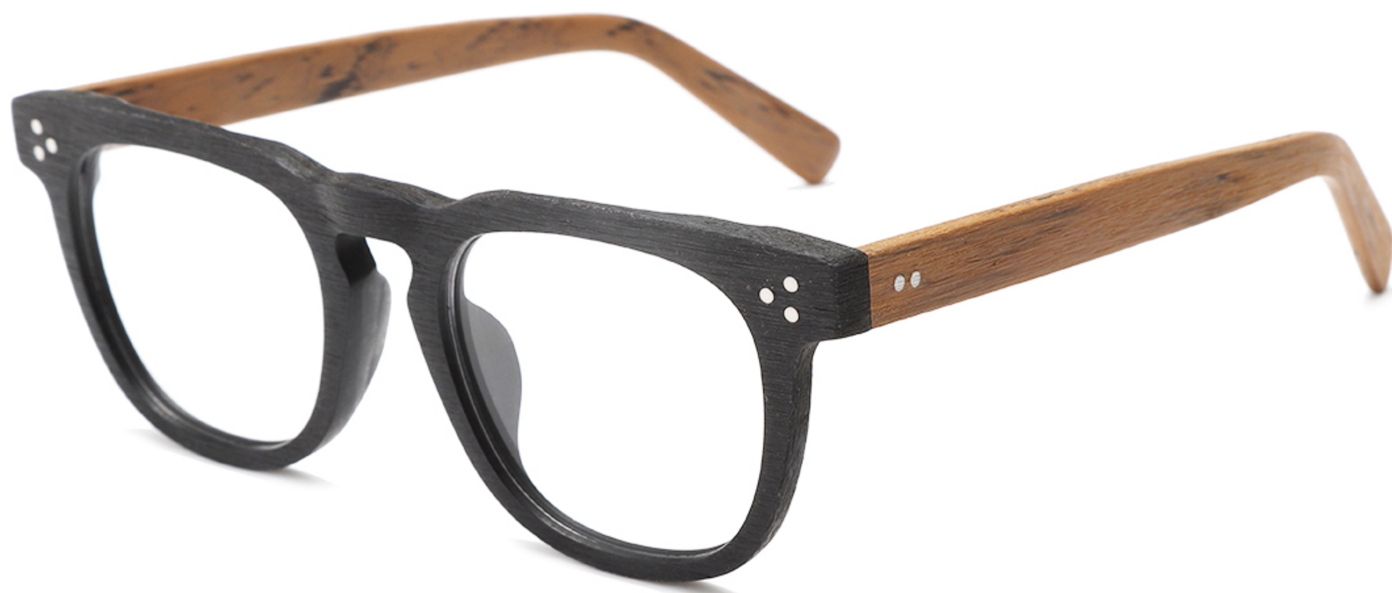
BLACK BROWN C86 黑框棕腿