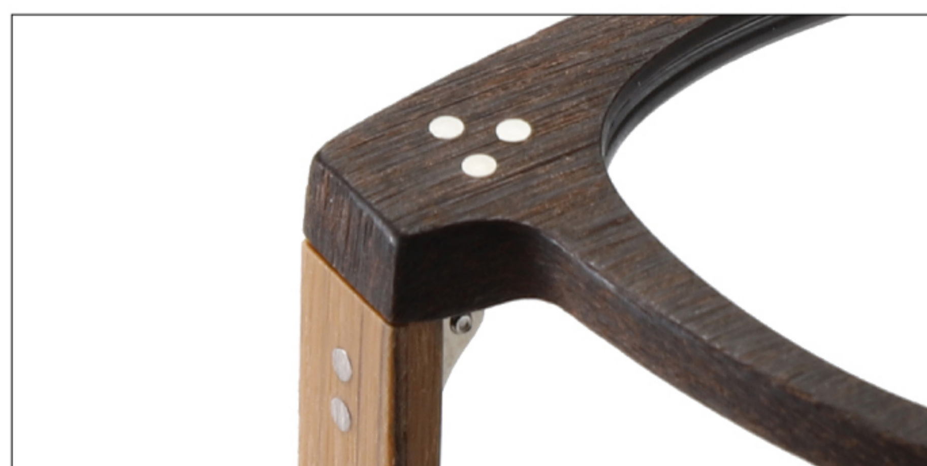
时尚设计 FASHION DESIGN