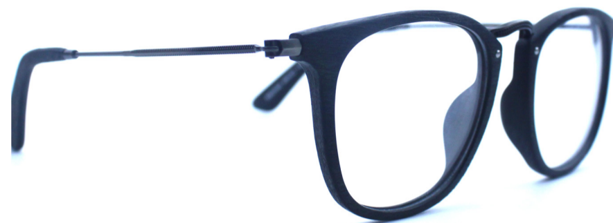
RB2446 C10 (2)