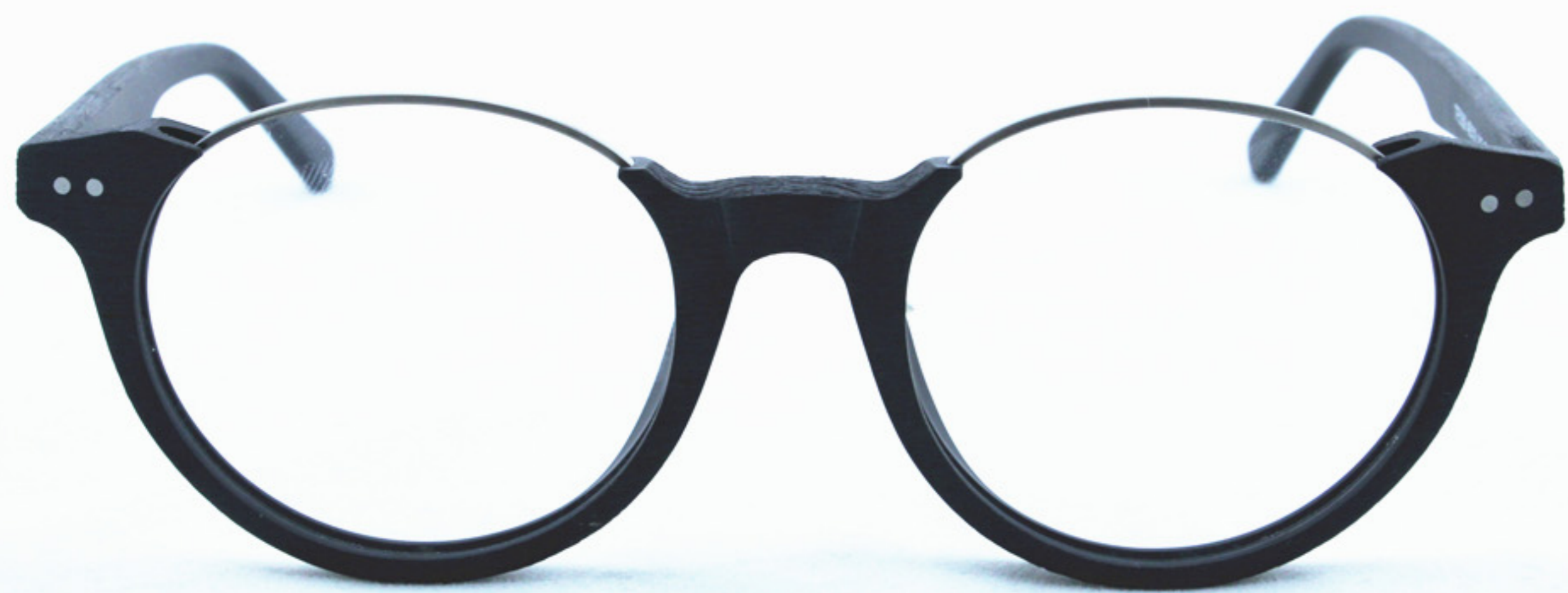
TF5359 C10 (1)