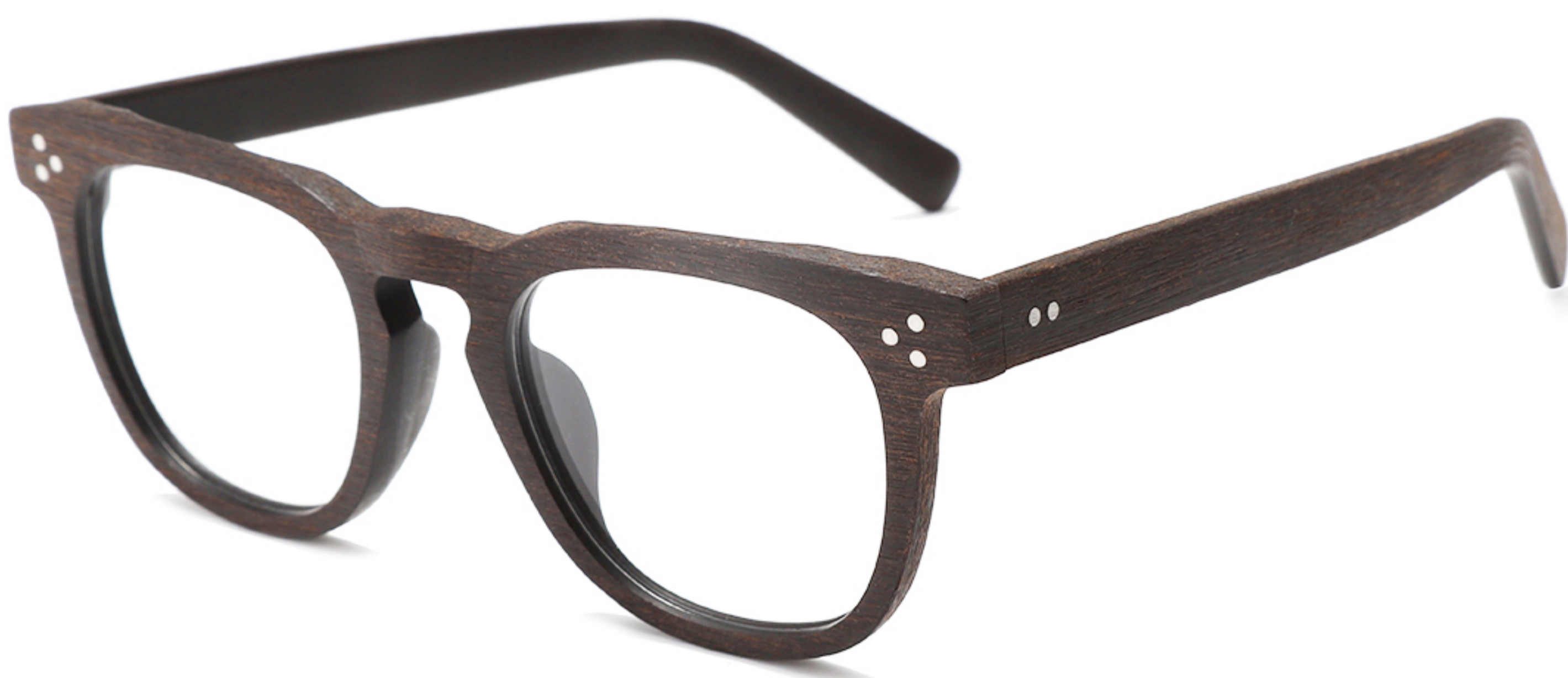
COFFEE C19 咖啡框