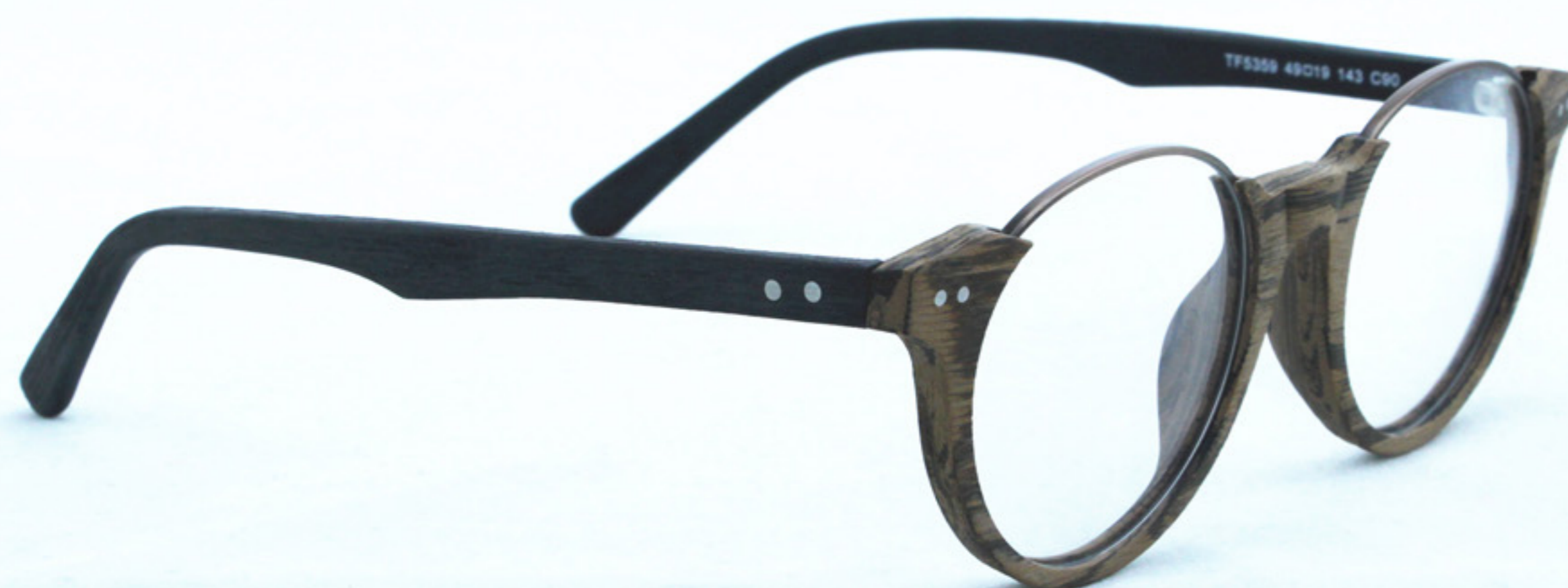
TF5359 C90 (2)