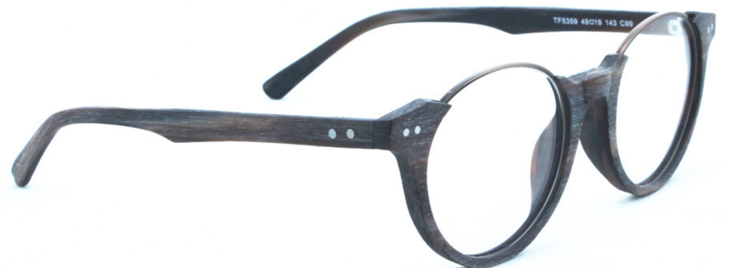
TF5359 C99 (2)