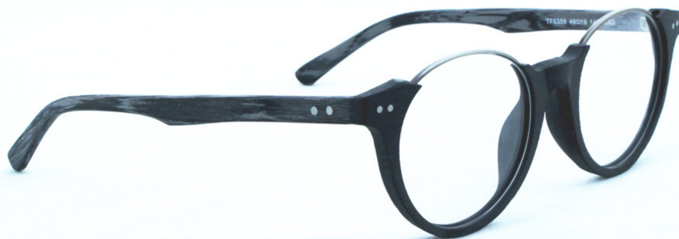
TF5359 C82 (2)