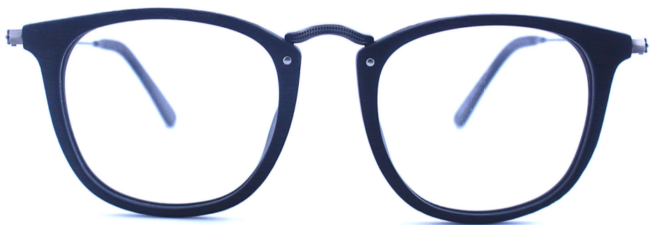
RB2446 C10 (1)