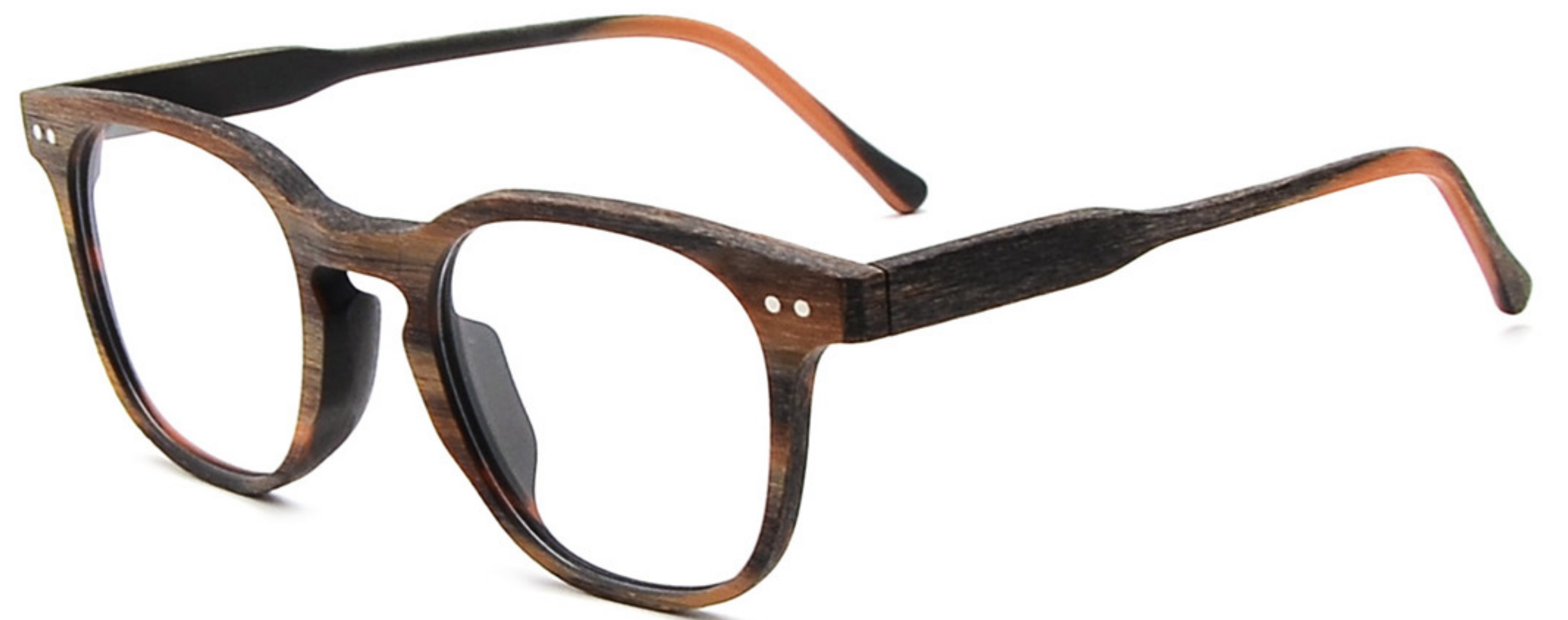
WOOD GRAIN DEMI C99 木纹玳瑁