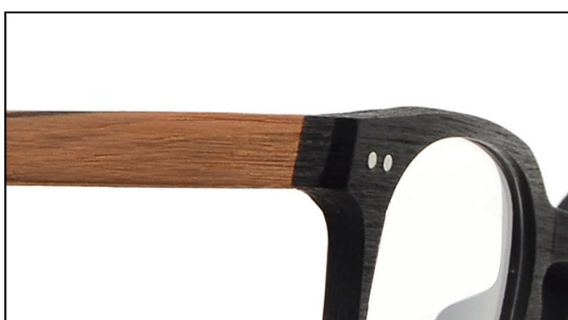
时尚设计 FASHION DESIGN