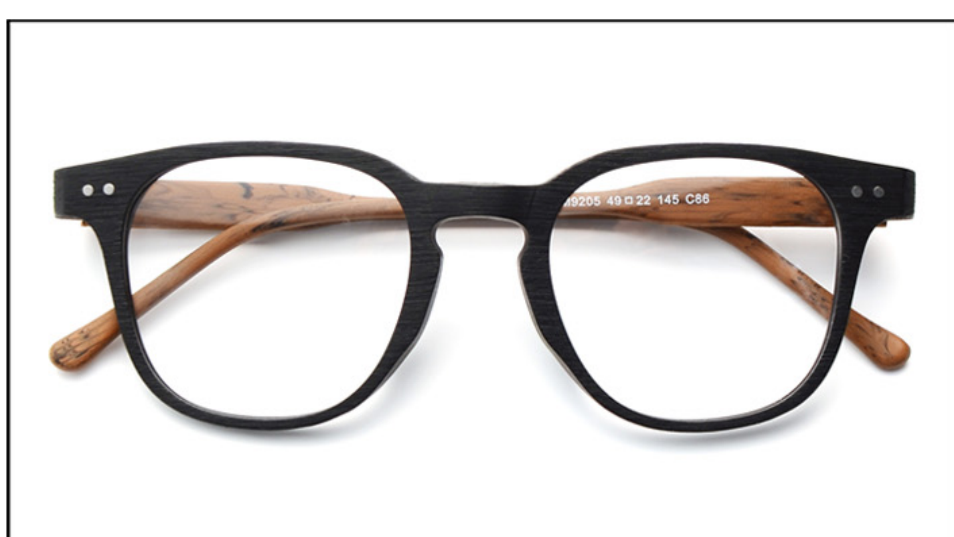
框架眼镜 FRAME GLASSES