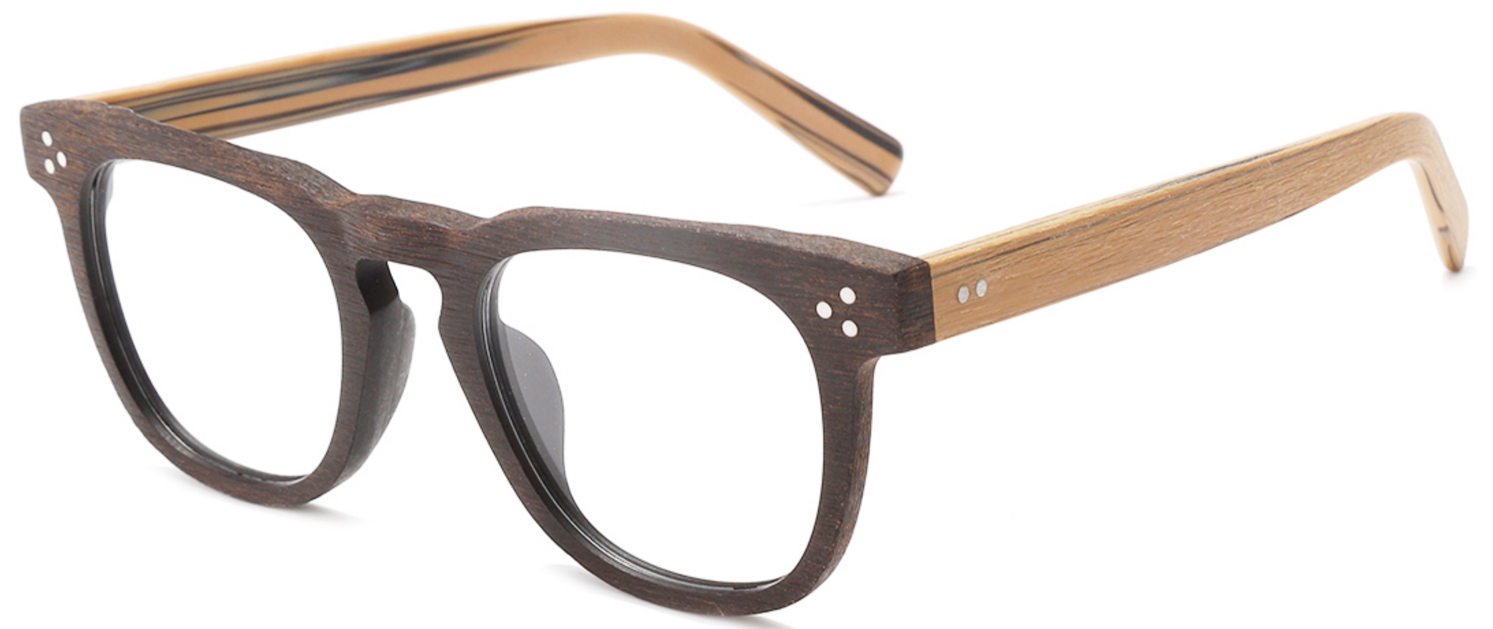
OFFEE BROWN C62 咖啡框浅棕腿