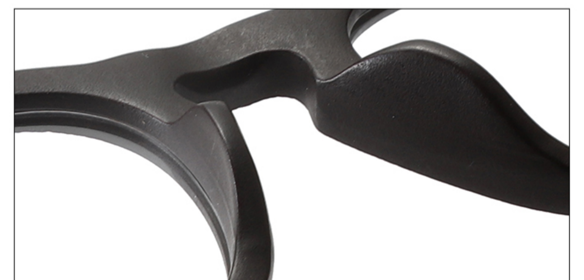
舒适鼻托 NOSE PAD