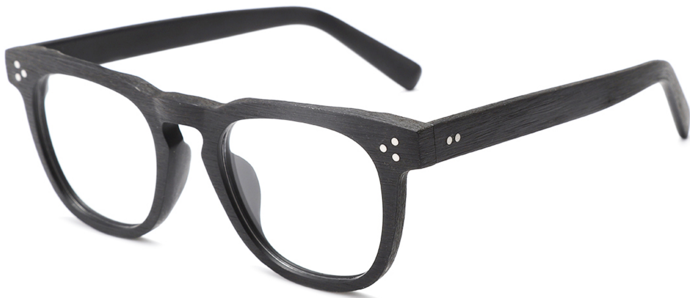
BLACK C10 黑框