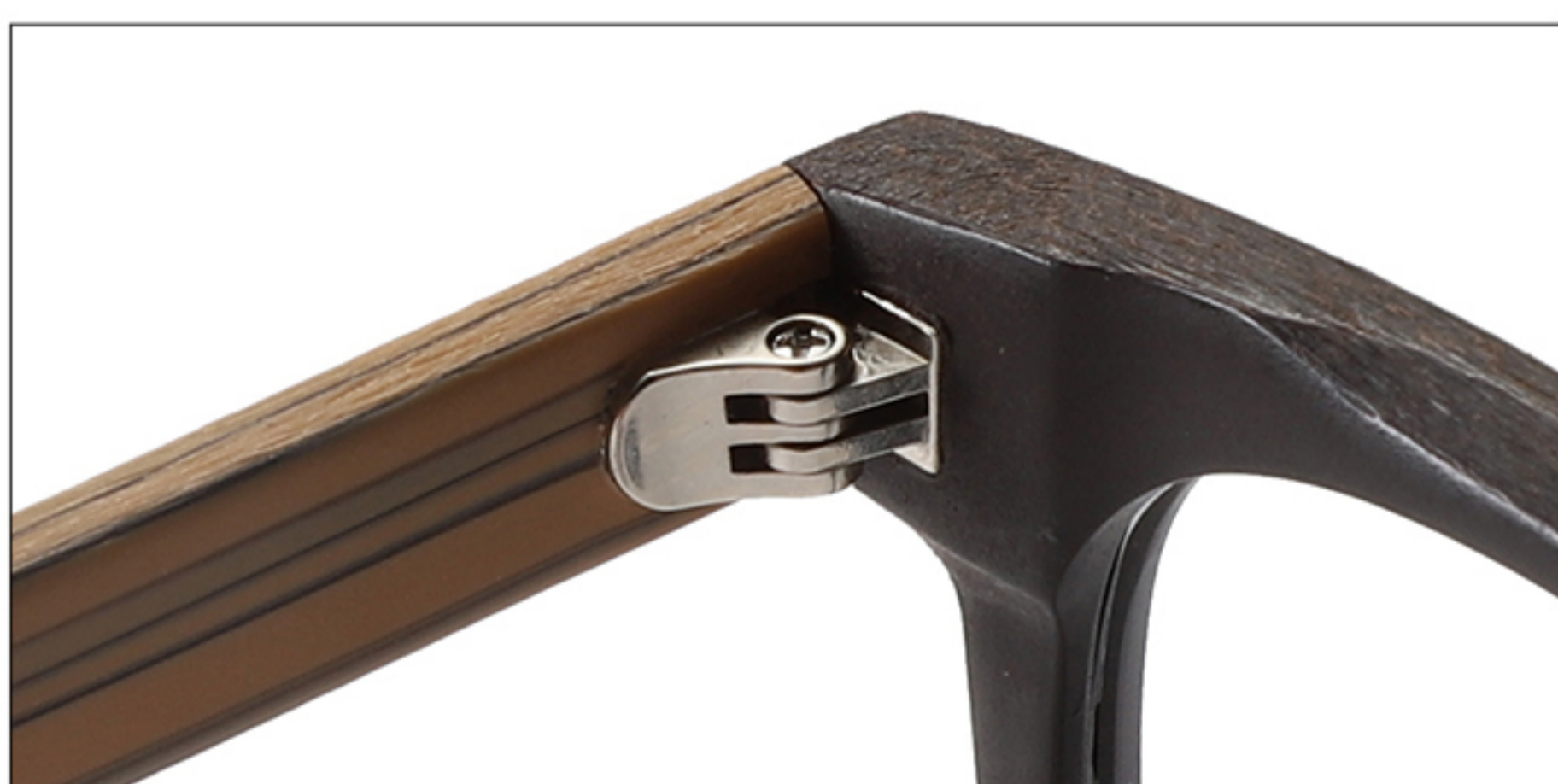
金属铰链 METAL HINGE