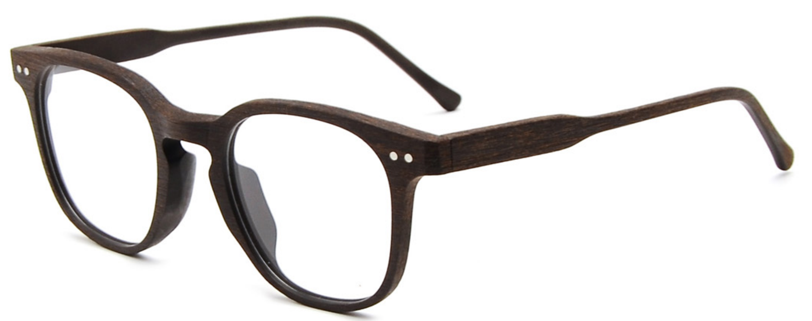
WOOD GRAIN BROWN C19 木纹茶