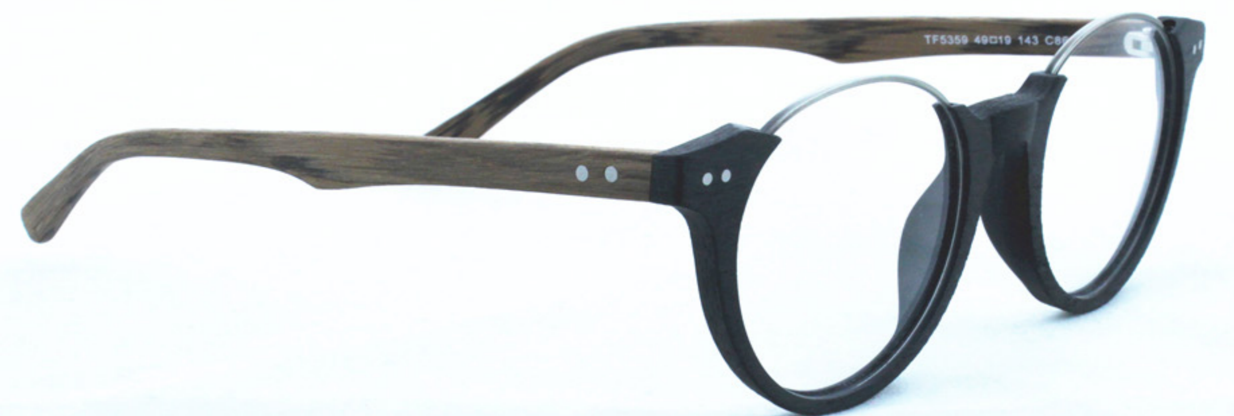
TF5359 C86 (2)